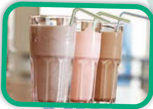
Milkshakes £2.00 Vanilla, Strawberry, Chocolate