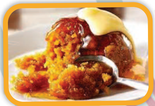
Sticky Toffee Pudding £3.25 Served with custard