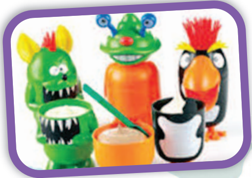
Ice Cream £3.00